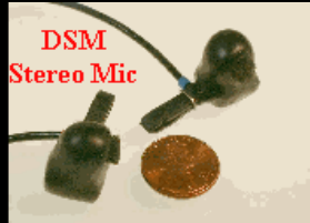
DSM Stereo Mic

Eye-gear/Headband/HRTF Baffle mountable matched omni mics