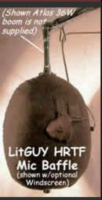
LitGUY HRTF Mic Baffle (shown w/optional Windscreen)

MONO ONLY 'Lombardo' Lapel Mic for interview, Narration, Lecture, and clip-on acoustic instrument Recording