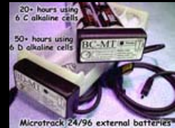
20+ hours using 6 C alkaline cells 50+ hours using 6 D alkaline cells Microtrack 24/96 external batteries