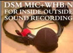
DSM MIC+WHB/N FOR INSIDE/OUTSIDE SOUND RECORDING

Eye-gear/Headband/HRTF Baffle mountable matched omni mics