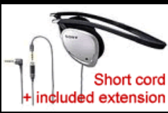
Short cord + included extension

Field/Studio Monitoring Headphones, Reviews