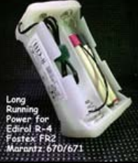
Long Running Power for Edinol R-4, Fostex FR2, Marantz 670/671

Field/Studio Monitoring Headphones, Reviews